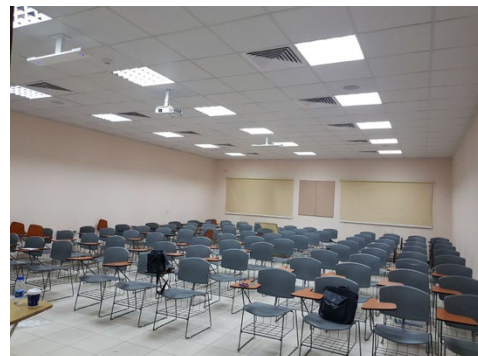
Taif University recently completed a major upgrade of its virtual collaboration capabilities with ClearOne audio solutions.

In addition, according to Yousef, classes with many students found it very difficult to constantly move the microphone between participants for the far end of the room to clearly hear questions and discussions. In